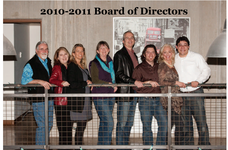
2010-2011 Board of Directors